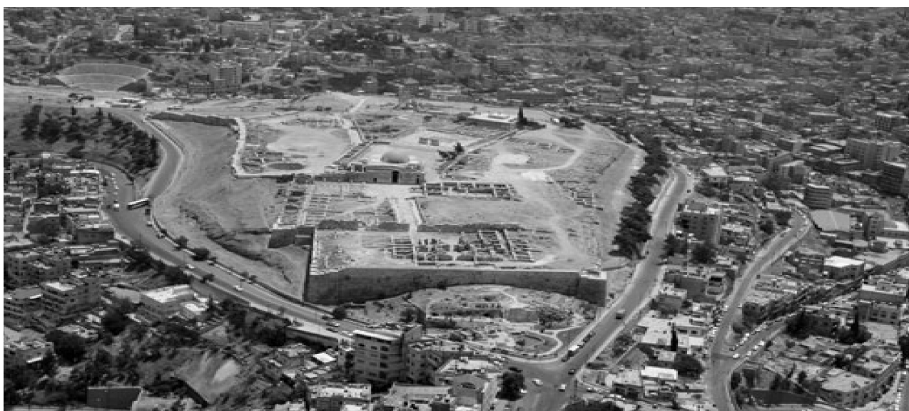
Fig. 1 Amman citadel.

When Transjordan passed into Arab rule in the 7th century AD, its Umayyad rulers restored the city's original name of Amman. Neglected under the Abbasids and abandoned by the Mamlukes, the city's fortunes did not revive until the late 19th century—under the Ottoman Empire. Amman became the capital of the Emirate of Transjordan in 1921 and the newly-created Hashemite Kingdom of Jordan in 1947. Greater Amman (the core city plus suburbs) today remains by far the most important urban area in Jordan, containing over half of the country's population or about 3 million out of 5 million people [12].