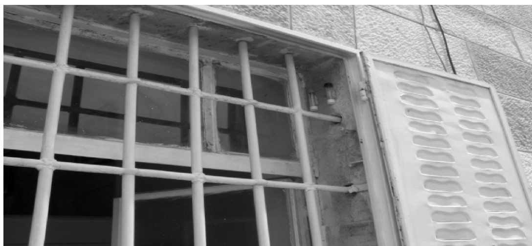
Fig. 4 The air quality monitoring tubes.