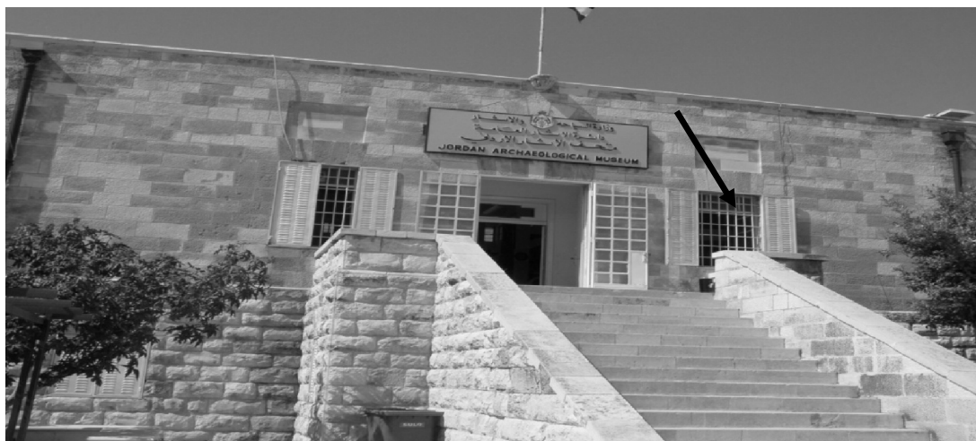
Fig. 3 Jordan archaeological museum (where the tubes were installed).

The tubes (Fig. 4) work by a process called molecular diffusion. The white cap of the tube filters out particles while the colored cap contains the